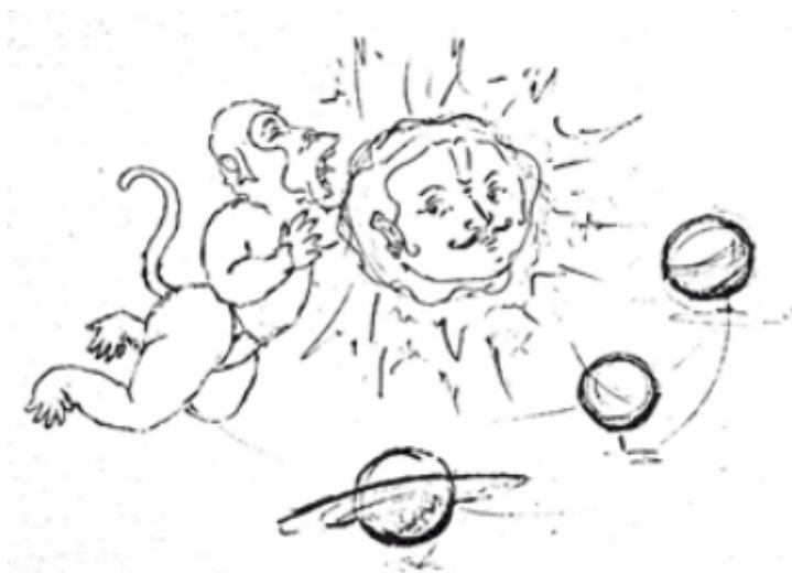
Figure 2 - Hanumaan approaching Suryadeva

That caused a terrible havoc (haahaakaar) in the entire universe as it was enveloped with darkness. Despite warnings from Indradeva, Hanumaan did not release Suryadeva from his mouth. At last, Indradeva lost his patience and hit Hanumaan with his Vajra injuring Hanumaan's jaw, thus he was called Hanumaan. Hanumaan's primary duty was to serve Raam which he performed in a superb manner. He always made his best efforts to serve Raam even at the cost of his own life. He performed his duty without expecting any reward in return. He did not care