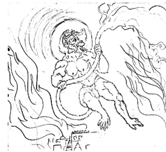
Figure 11 - Hanumaan burning Lankaa

However, Raavan responded with anger, showered insults on Hanumaan and ordered his soldiers to put fire on Hanumaan's tail. After burning a greater part of Lankaa with his burning tail (Figure 11), Hanumaan flew back to other shore of the ocean and informed whereabouts of Seetaa to Raam. Raam, Lakshman, Hanumaan, Sugriva, Angad, and other monkey warriors crossed the ocean through a bridge built with the help of two monkey soldiers – Nal and Neel- who were blessed with a boon that stones thrown out by them into water will not sink. They built a bridge by throwing stones into the water. Recently, NASA of USA discovered the presence of this bridge submerged in the water between current