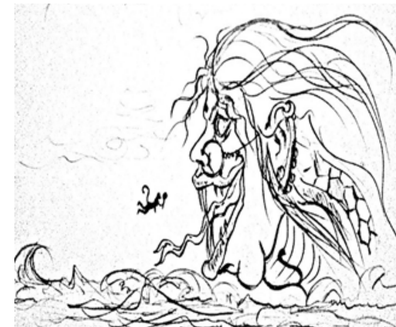
Figure 7 - Micro Hanumaan entering into the mouth of Sursa

At that moment, Hanumaan shrank his size to that of a mosquito and before Sursa could match up to that size he entered her large mouth and quickly slipped out (Figure 7).