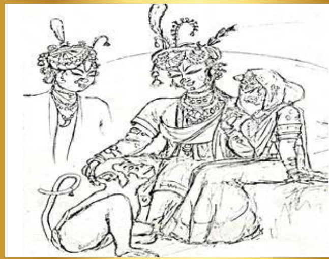
Hanumaan with Raam, Seetaa, and Lakshman