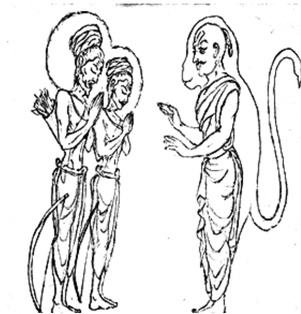
Figure 4 - Hanumaan in disguise meeting Raam and Lakshman

Hanumaan was extremely happy to meet them as he has been looking for Raam for a long time. Hanumaan paid his obeisance (pranaam) to Raam and since that time he became a staunch Raam Bhakta. Hanumaan introduced Raam to Sugriva whereby they became friends of each other. Due to this friendship Raam killed Baali, rescued Sugriva's wife, and made Sugriva the king of Kishkindha.