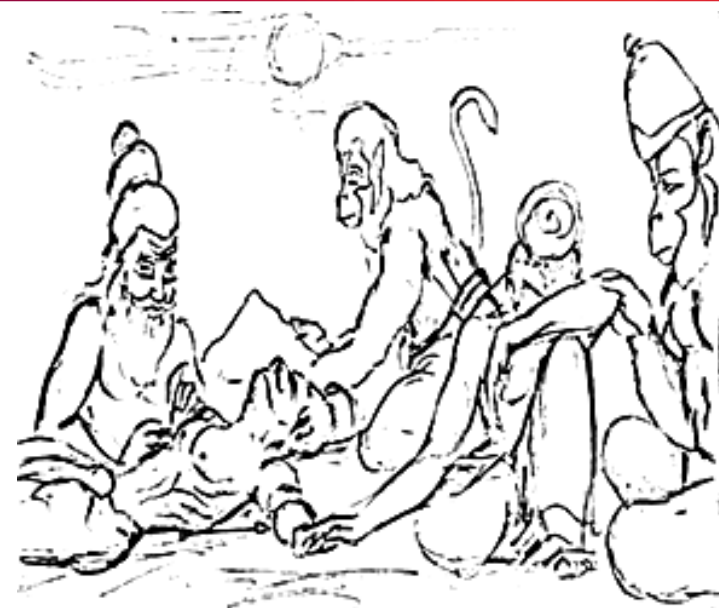
Figure 5 - Wounded Lakshman

and brought it to Lanka (Figure 6), again overcoming several obstacles. The Lankan doctor identified the herb that saved the life of Lakshman. Hanumaan will be happy if we help to treat a sick person or save person's life. Can we please Hanumaan by chanting Hanumaan Chalisa and at the same time be involved in manufacturing and supplying fake medicines? Will Hanumaan be happy if doctors and hospitals let patients die because they are unable to pay in advance?