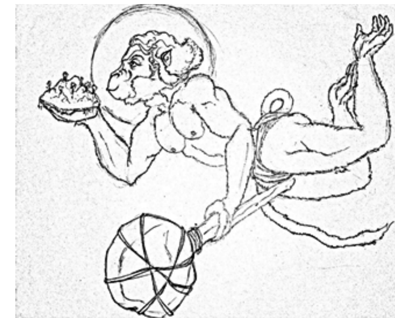
Figure 6 - Hanumaan carrying a mountain with Sanjeevani for Lakshman

and brought it to Lanka (Figure 6), again overcoming several obstacles. The Lankan doctor identified the herb that saved the life of Lakshman. Hanumaan will be happy if we help to treat a sick person or save person's life. Can we please Hanumaan by chanting Hanumaan Chalisa and at the same time be involved in manufacturing and supplying fake medicines? Will Hanumaan be happy if doctors and hospitals let patients die because they are unable to pay in advance?