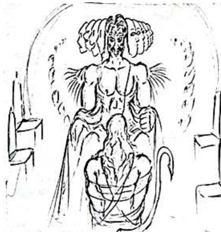
Figure 10 - Captured Hanumaan before Raavan