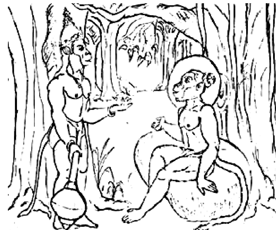
Figure 3 - Hanumaan meeting Sugriva

Baali was the king of Kishkindha city and his younger brother Sugriva lived with him. Because of some misunderstandings, Baali became angry with Sugriva, banished him from the kingdom, and took his wife Ruma. Upon the advice of Suryadeva, Hanumaan went to meet Sugriva who lived in Matang Rishi's ashram in Rishiyamukh mountains (Figure 3). Hanumaan became Sugriva's friend as well as an advisor. When Sugriva was helpless, Hanumaan provided him full protection. Baali dare not touch Sugriva in the presence of Hanumaan. While looking for Seetaa who was kidnapped by the demon Raavan, Raam and Lakshman came to the area where Sugriva lived. Hanumaan met them in disguise but revealed his identity when he came to know these two strangers were none other than Raam and Lakshman (Figure 4).