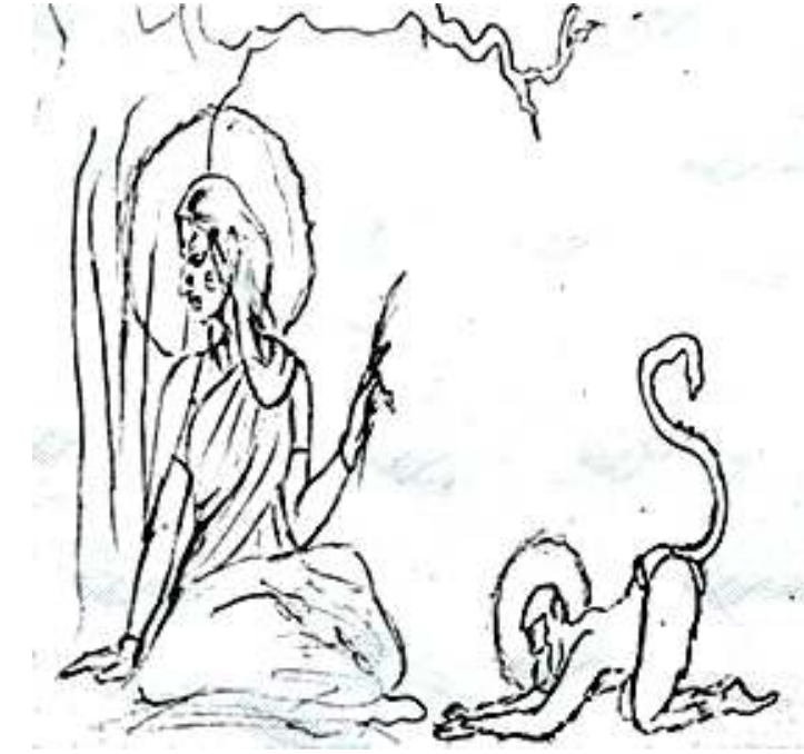
Figure 9 - Hanumaan meeting Seeta

Lankini was very powerful and no one was allowed to enter Lankaa without her permission. When she challenged Hanumaan, he hit her so hard that she could not bear the pain. This way he was able to subdue her and enter the city of Lankaa. Despite looking everywhere, Hanumaan could not find Seetaa for a long time. Finally, with the help of Raavan's brother Vibhishan, he was able to locate Seetaa sitting under a tree in Ashokvatikaa (Figure 9).