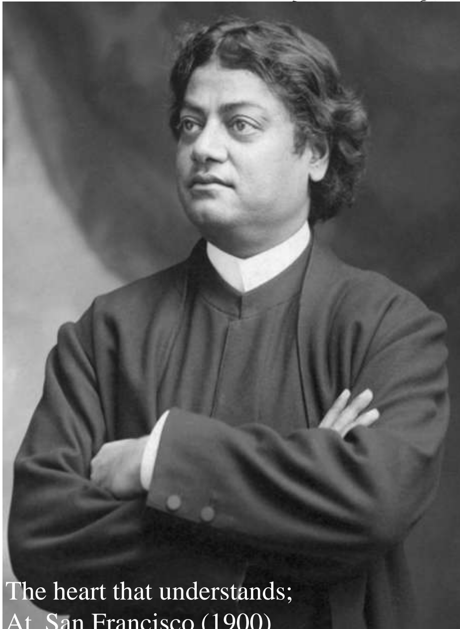
The heart that understands; At San Francisco (1900)

"Man-making is my mission of life. I am not a politician, nor am I a social reformer. It is my job to fashion man...I care only for the spirit: when that is right, everything will be righted by itself."