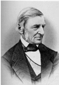
Ralph Waldo Emerson

Ralph Waldo Emerson , (1803-1882) author, essayist, lecturer, philosopher, Unitarian minister said this about the Gita: